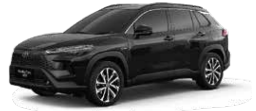
1K0/Metal Stream ME