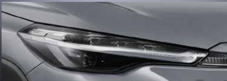
New LED Headlamp