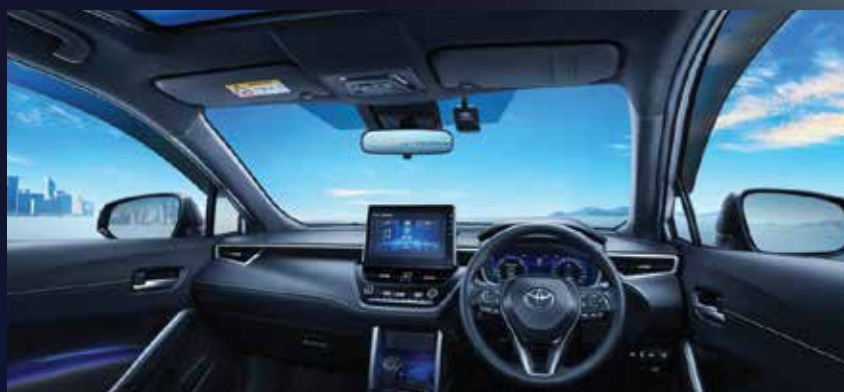
Sophisticated Dashboard Design