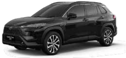
218/ Attitude Black MC