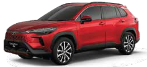
3U5/Emotional Red 2