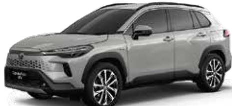
1H5/Cement Grey ME