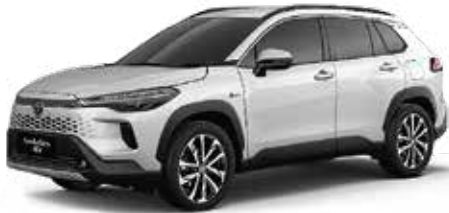
089/Platinum White Pearl