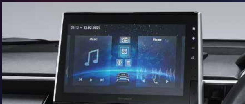
New 10" Multi-Purpose Head Unit with Wireless Smartphone Connectivity