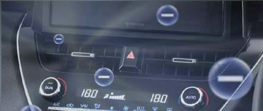
Dual Zone Auto Function AC