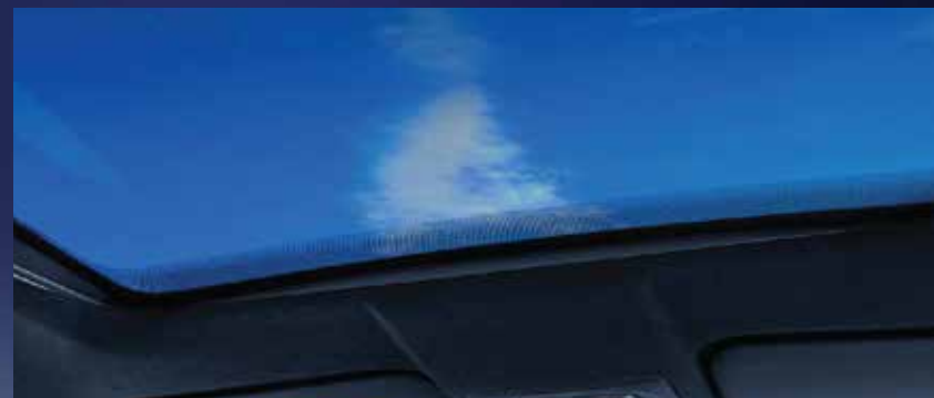
New Panoramic Retractable Roof