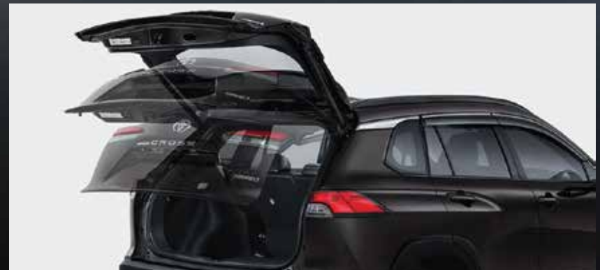
Power Backdoor with Kick Sensor Provides ease and convenience with just a simple kick