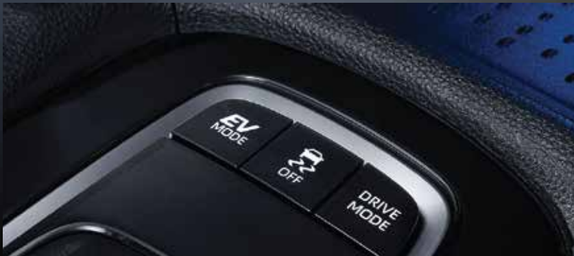
Advanced Drive Mode Offering Eco, Sport, and EV modes to suit different road conditions.