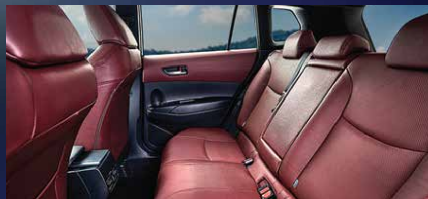
Rear Seats With 6° Recline Angle