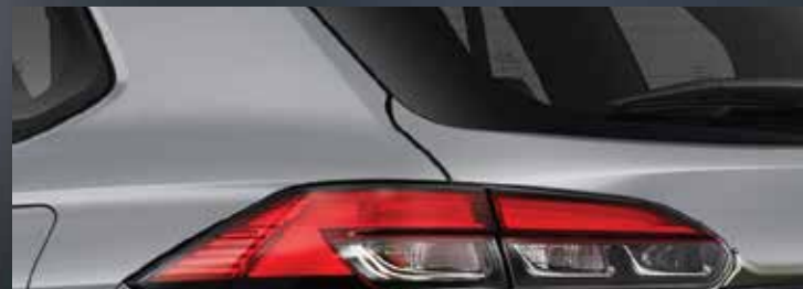
New Rear Combination Lamp