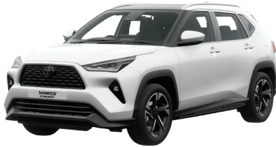
040/Super White 2