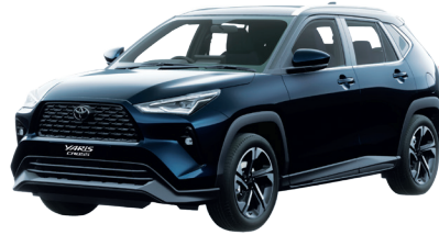
B88/Dark Turquoise SE.