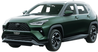
G64/Greenish Gun Metal M.M.