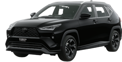
218/ Attitude Black MC